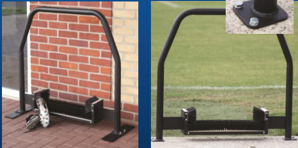
Freestanding Boot Wiper

Freestanding or Fixed for single-person use Designed for use outside communal changing areas; extremely sturdy and hard-wearing