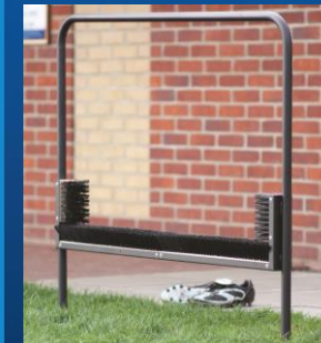
Multi Boot Wiper

Available as a 1, 2, 3 or 4-person station